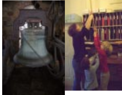
Above (clockwise from top): handmade signs outside the Chapel, parishioners ringing the bell, and the sweet bell itself.